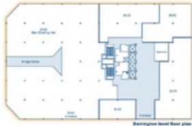
Barrington level floor plan