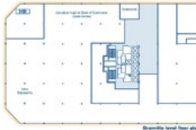
Granville level floor plan